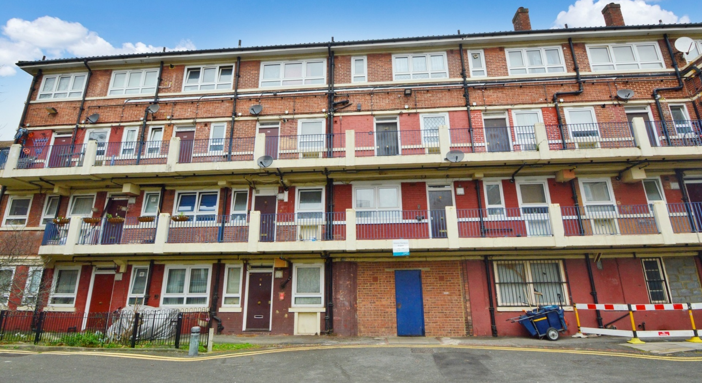
ADAMS GARDENS ESTATE SE16 2 bedroom duplex apartment