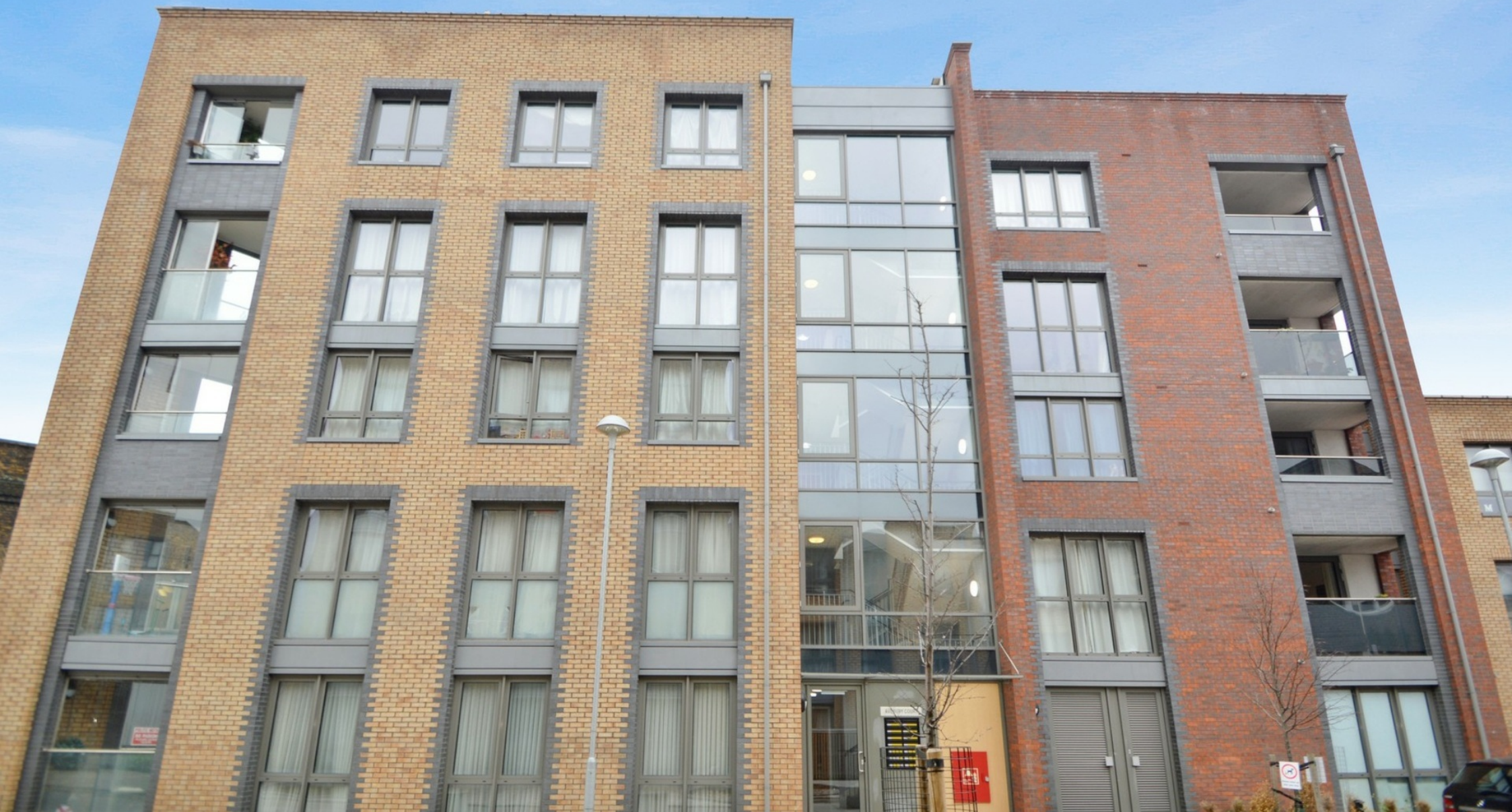
AVEBURY COURT SE16 1 bedroom apartment