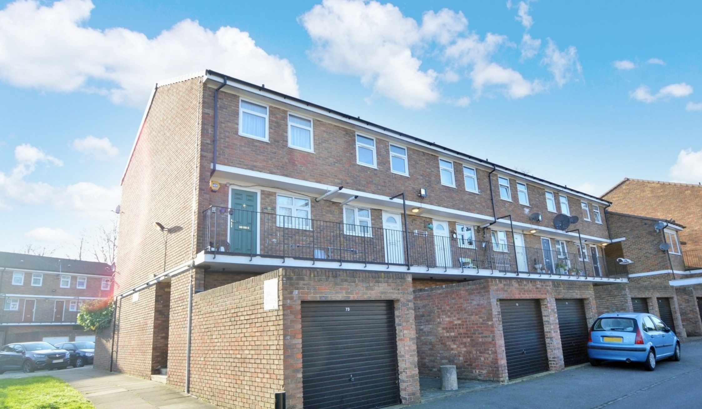
CONSTANTINE HOUSE SW2 3 bedroom duplex apartment