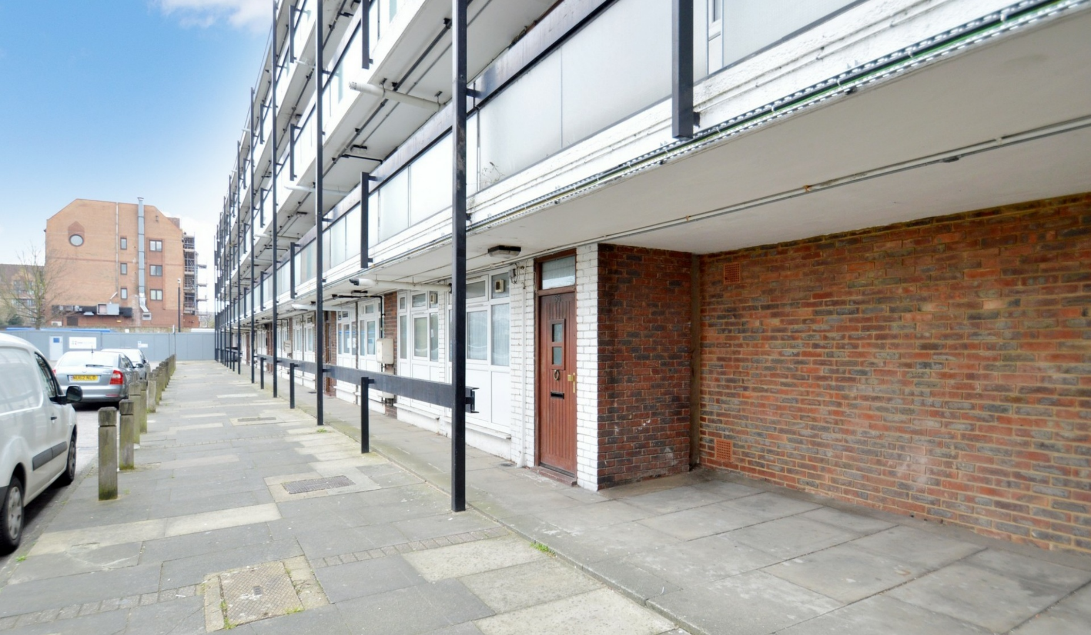
DAGMAR COURT E14 1 bedroom apartment