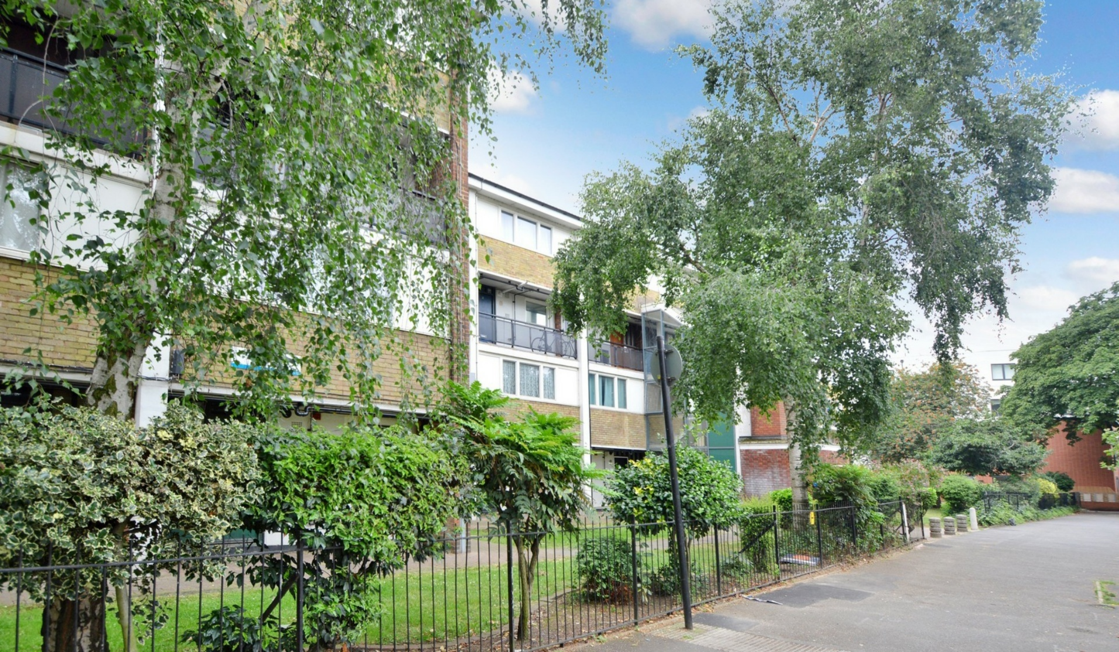
MANDEVILLE HOUSE SE1 3 bedroom maisonette