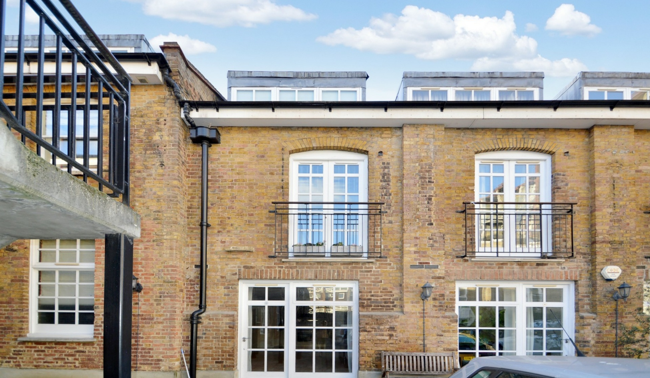
BATH HOUSE E2 1 bedroom apartment