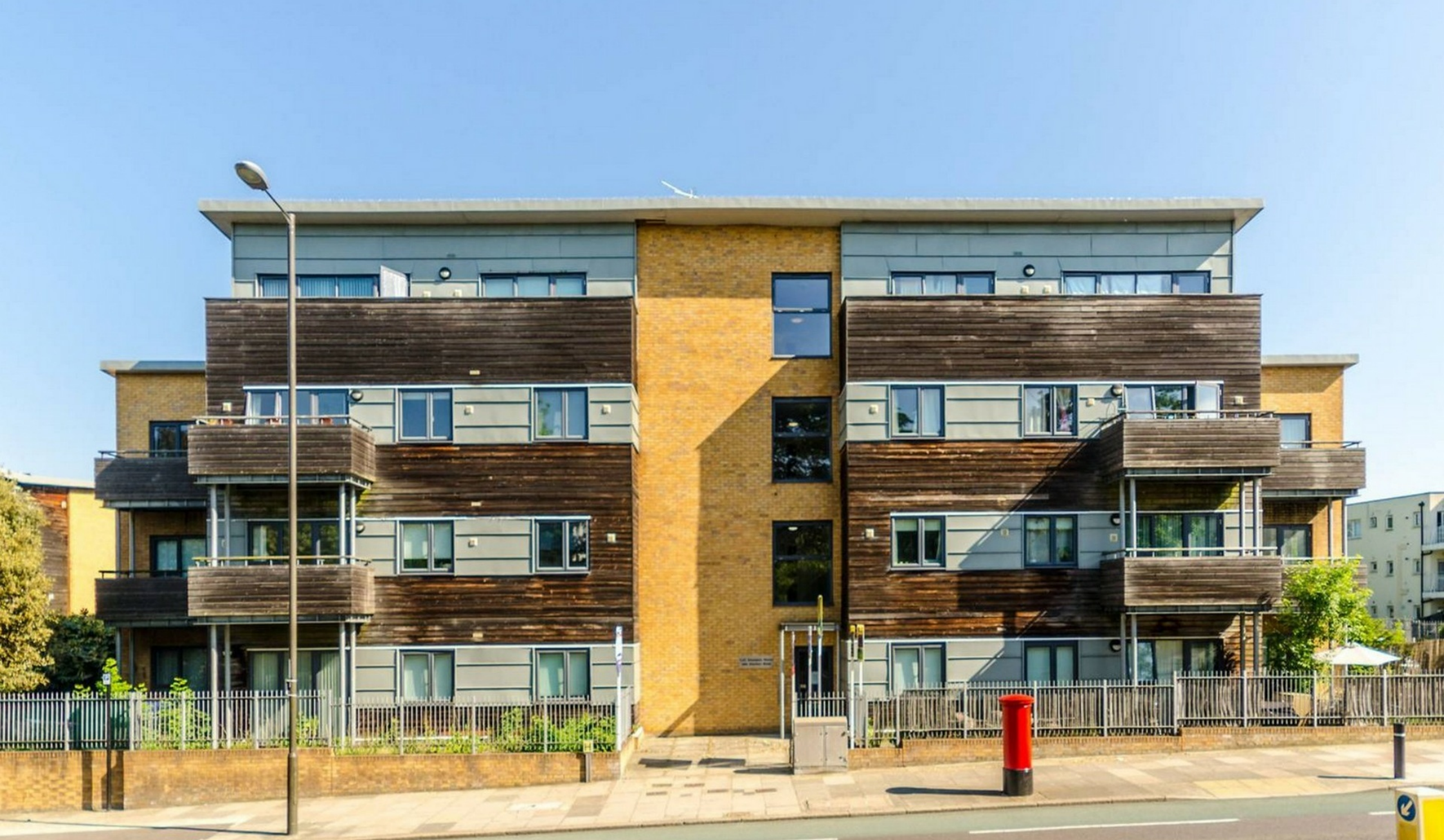
CHAMPION HOUSE SE7 1 bedroom penthouse