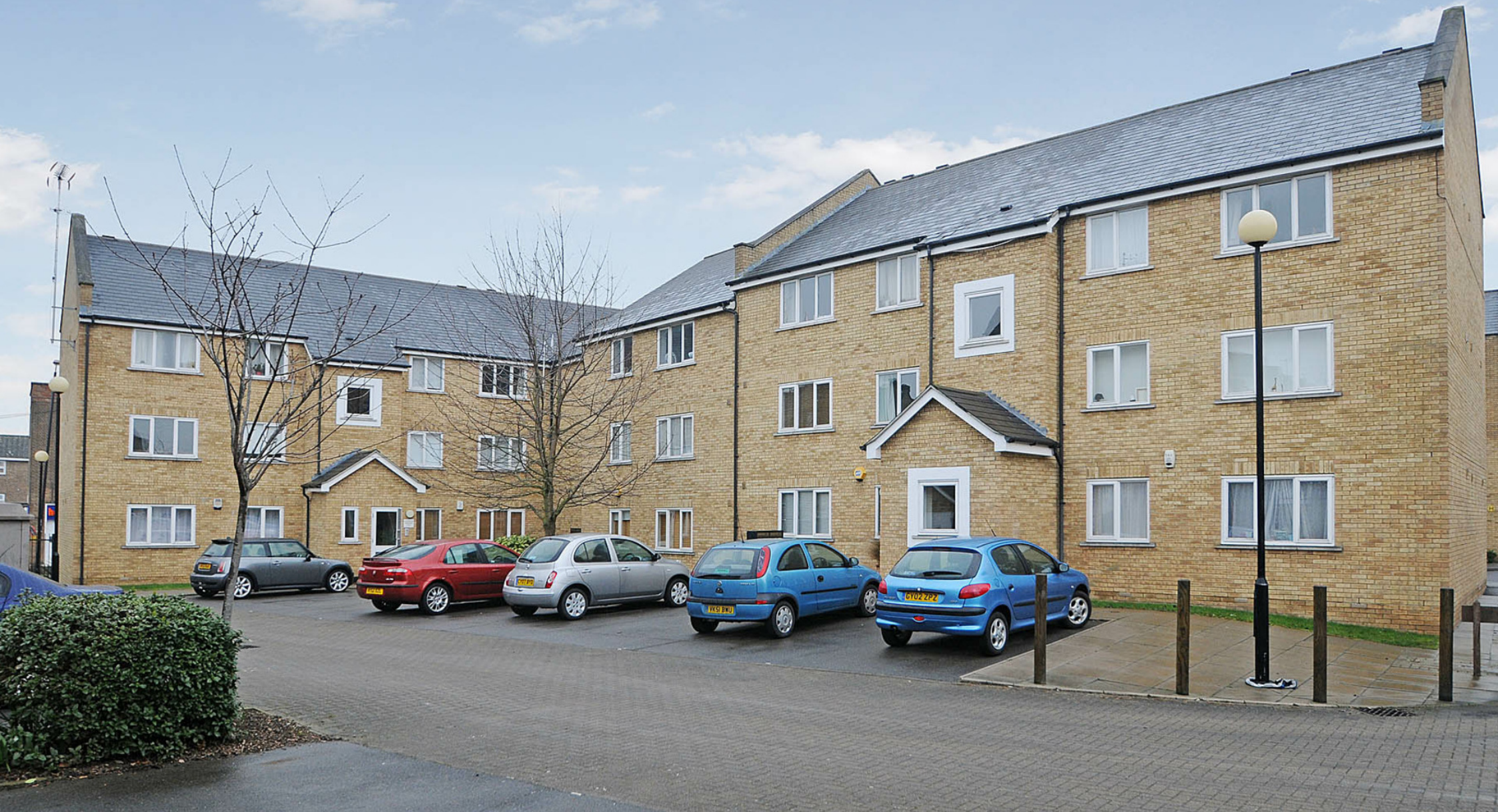
LANGBOURNE PLACE E14 2 bedroom apartment