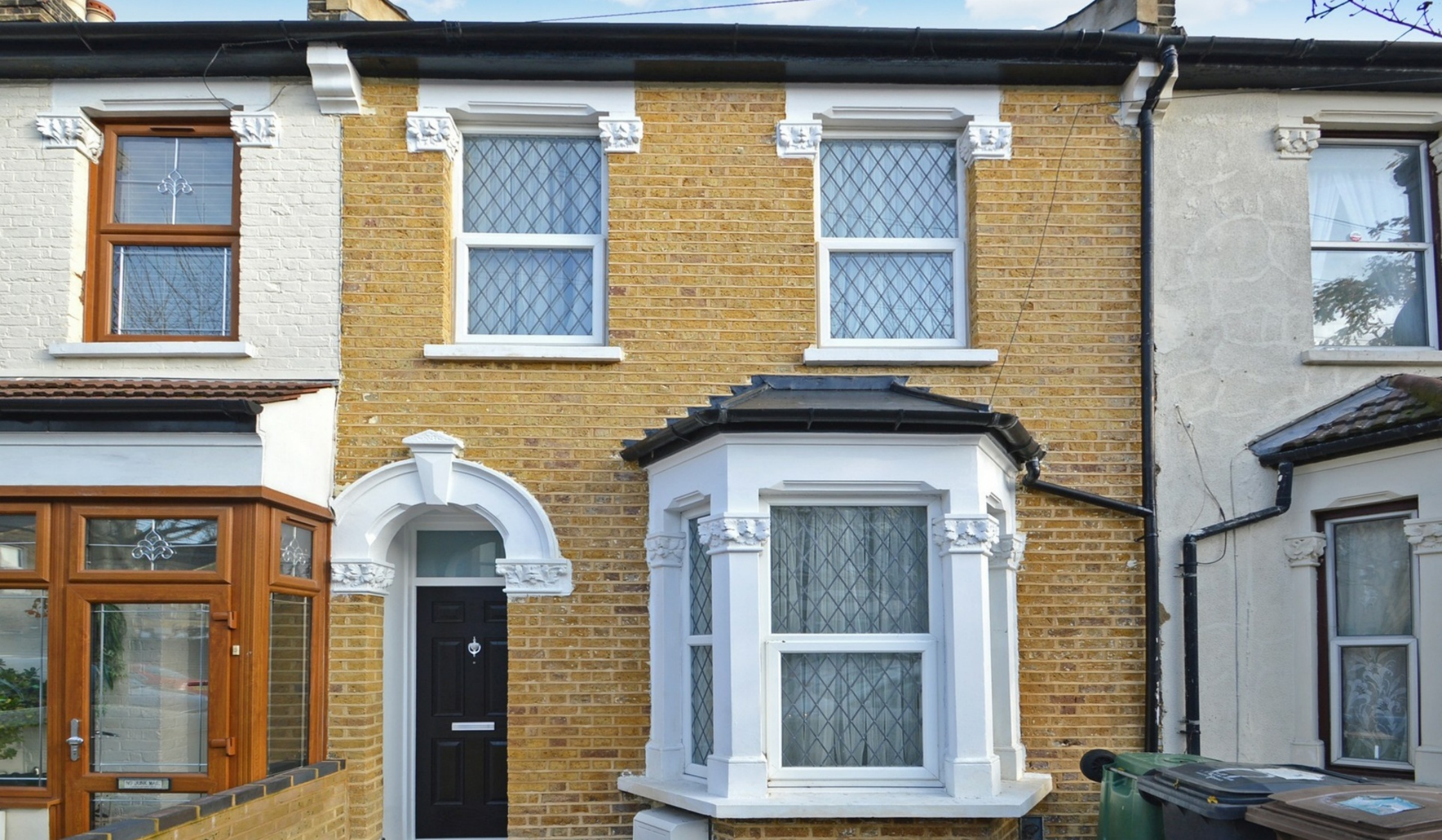
WHITNEY ROAD E10 5 bedroom terraced house