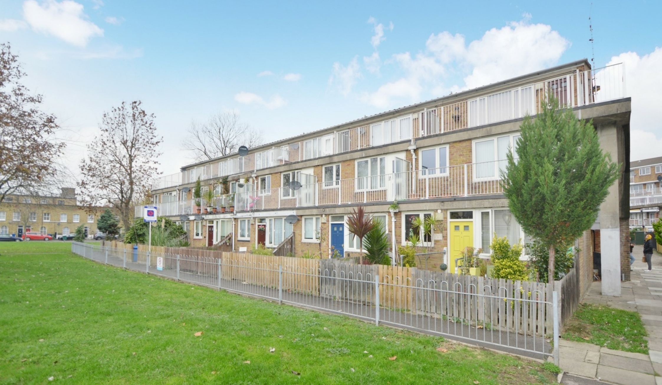
LUCEY WAY SE16 1 bedroom apartment