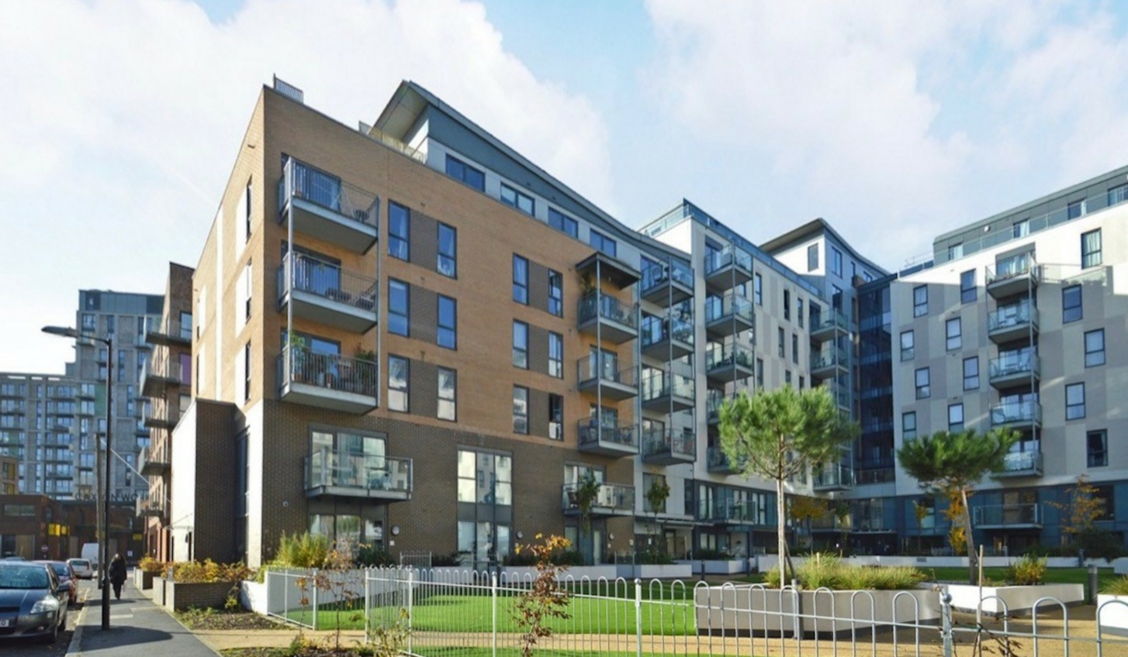
NEW CENTURY HOUSE E16 2 bedroom apartment