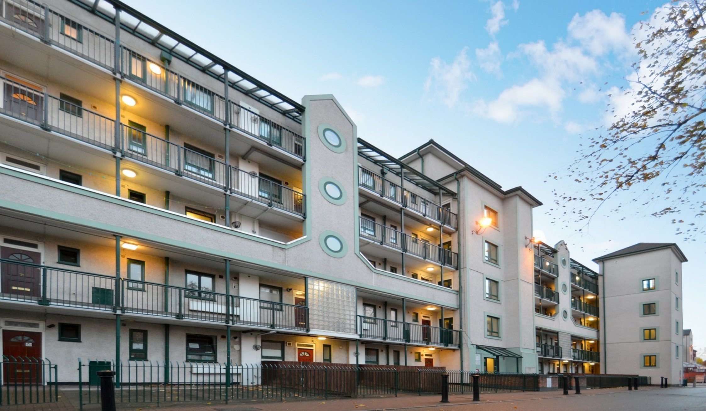
TASKER HOUSE E14 studio apartment