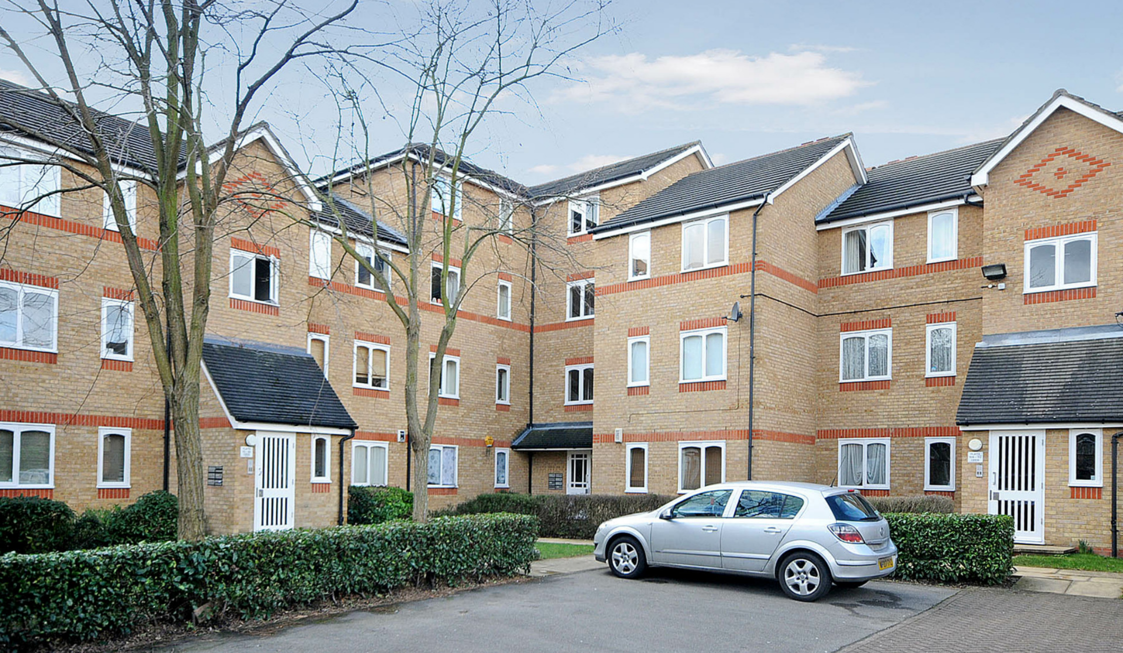
TELEGRAPH PLACE E14 1 bedroom apartment