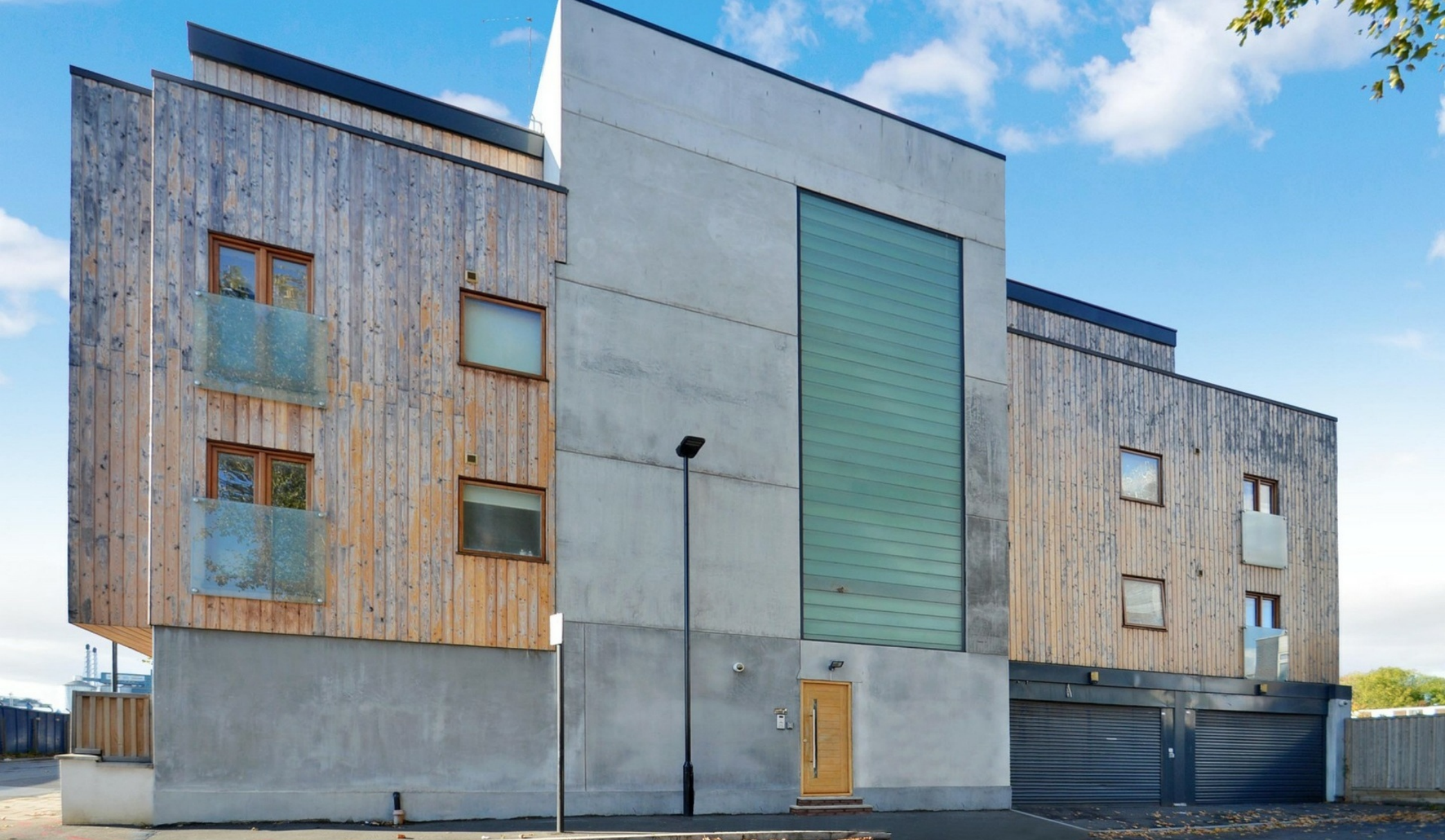
ANTWERP WAY E16 2 bedroom apartment