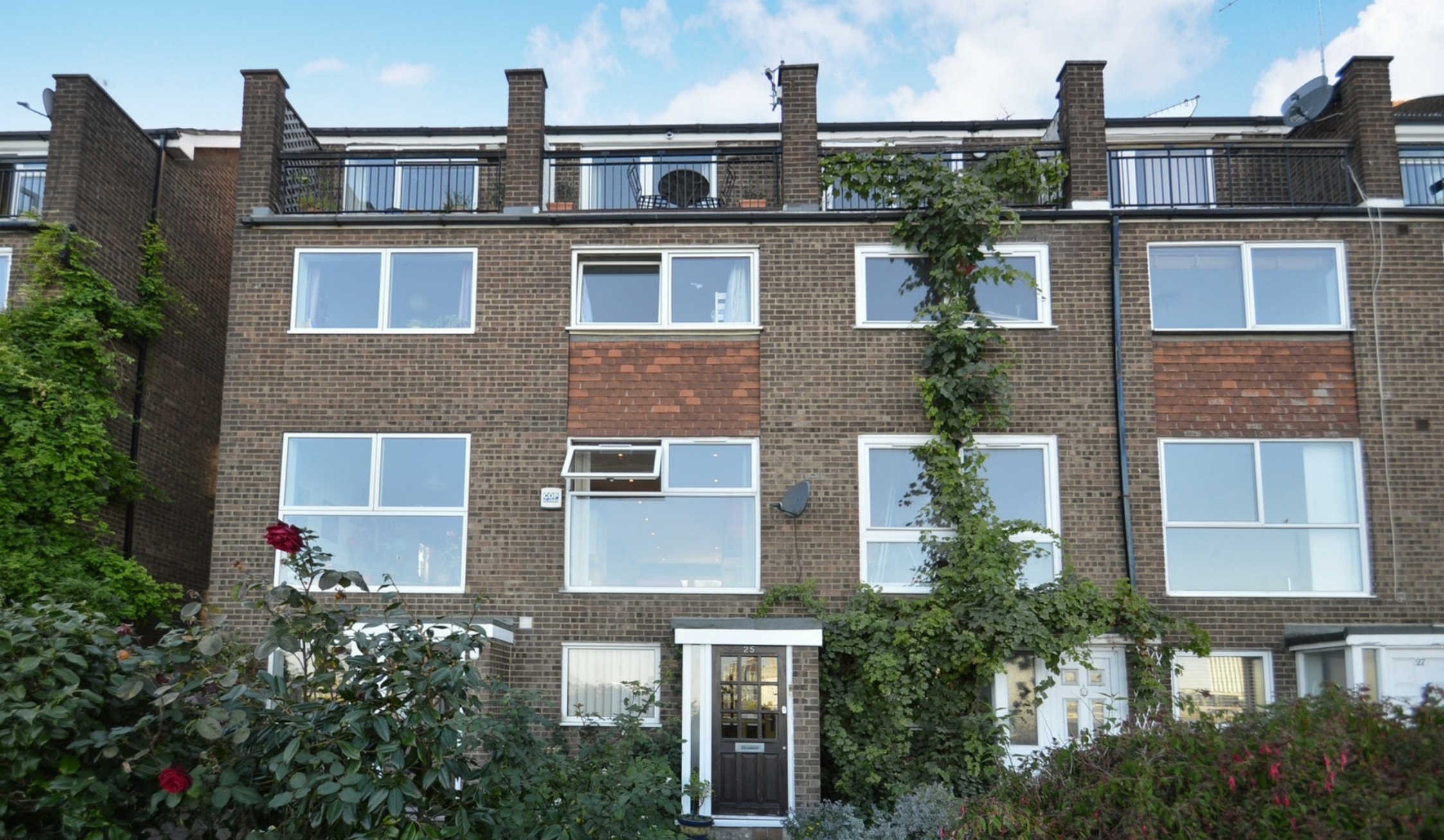
CAPSTAN SQUARE E14 4 bedroom town house