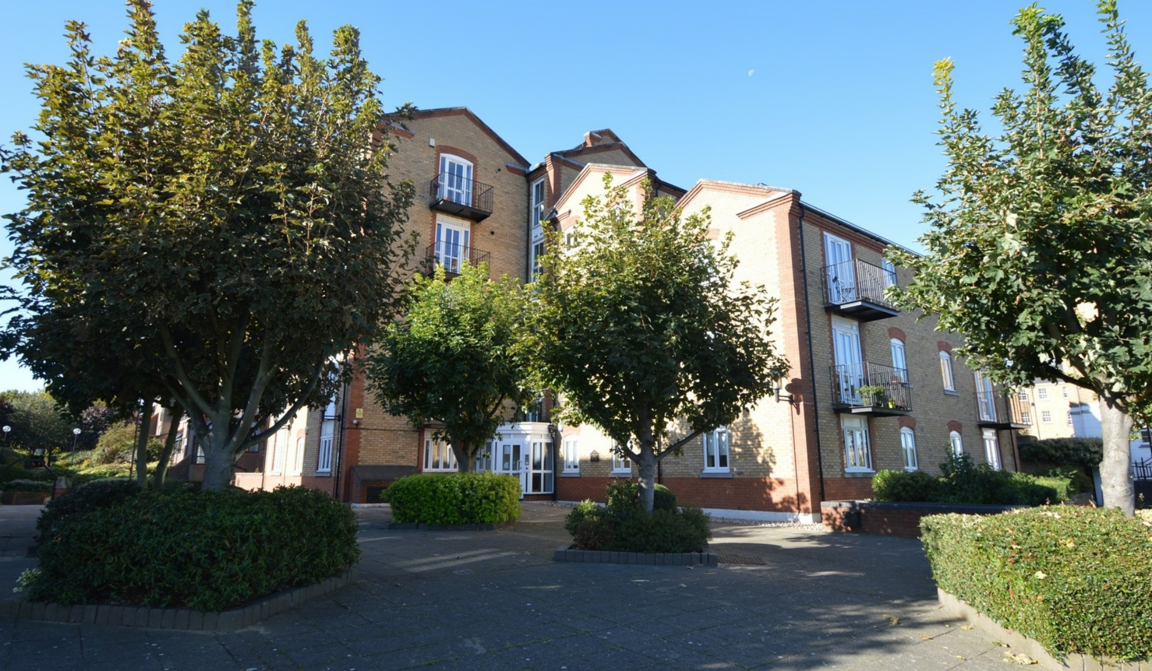
CALDER COURT SE16 2 bedroom apartment