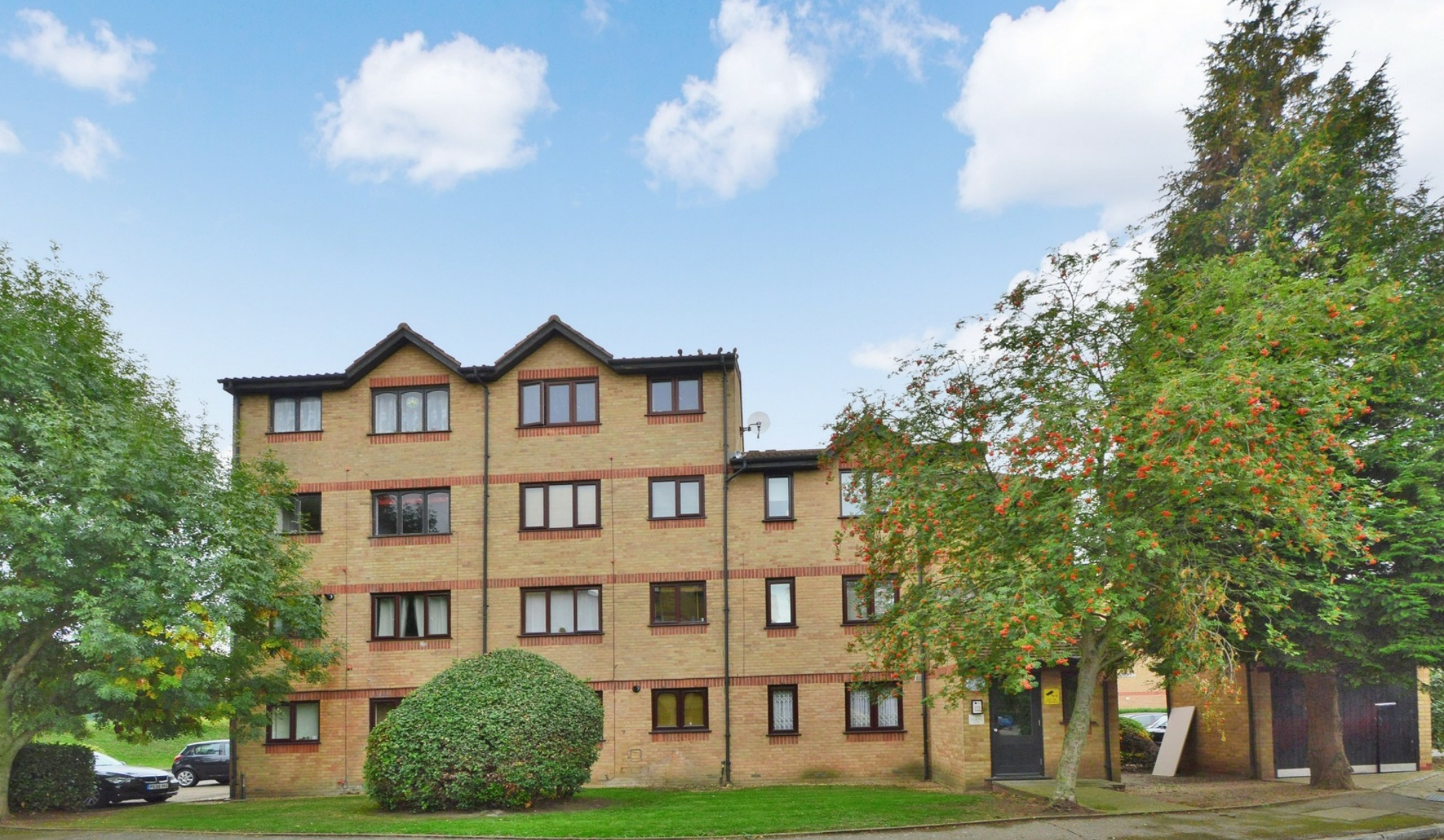
JEMOTTS COURT SE14 1 bedroom apartment