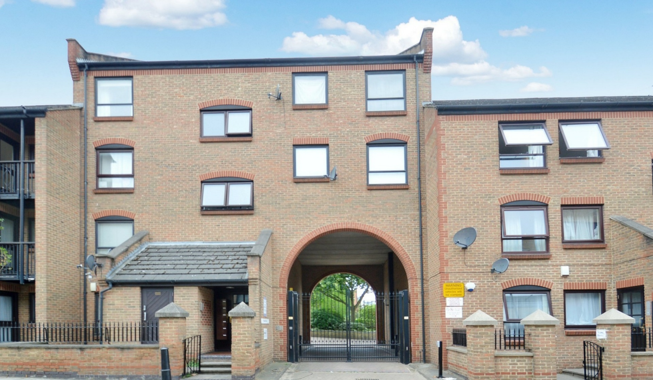
HORSESHOE CLOSE E14 2 bedroom apartment