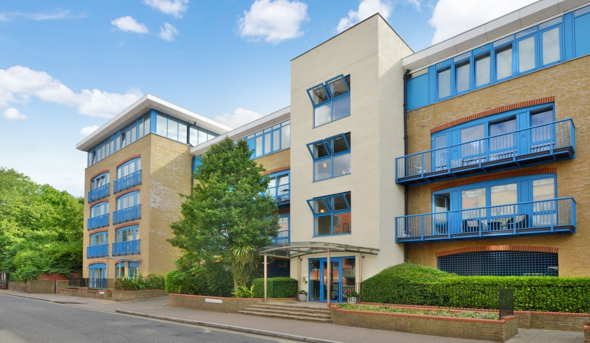
SOMERVILLE POINT SE16 3 bedroom apartment