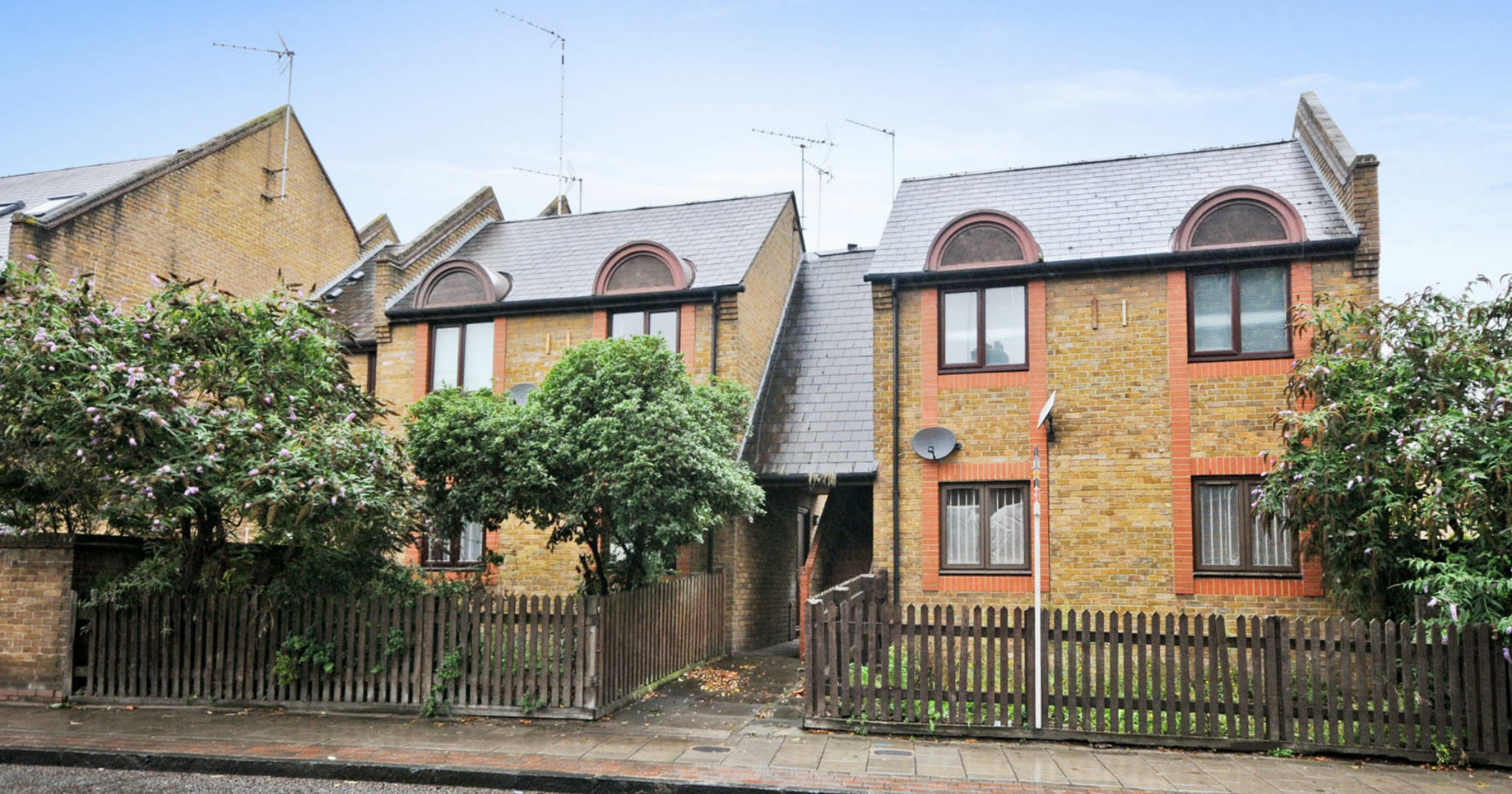
CLIFTON PLACE SE16 1 bedroom maisonette