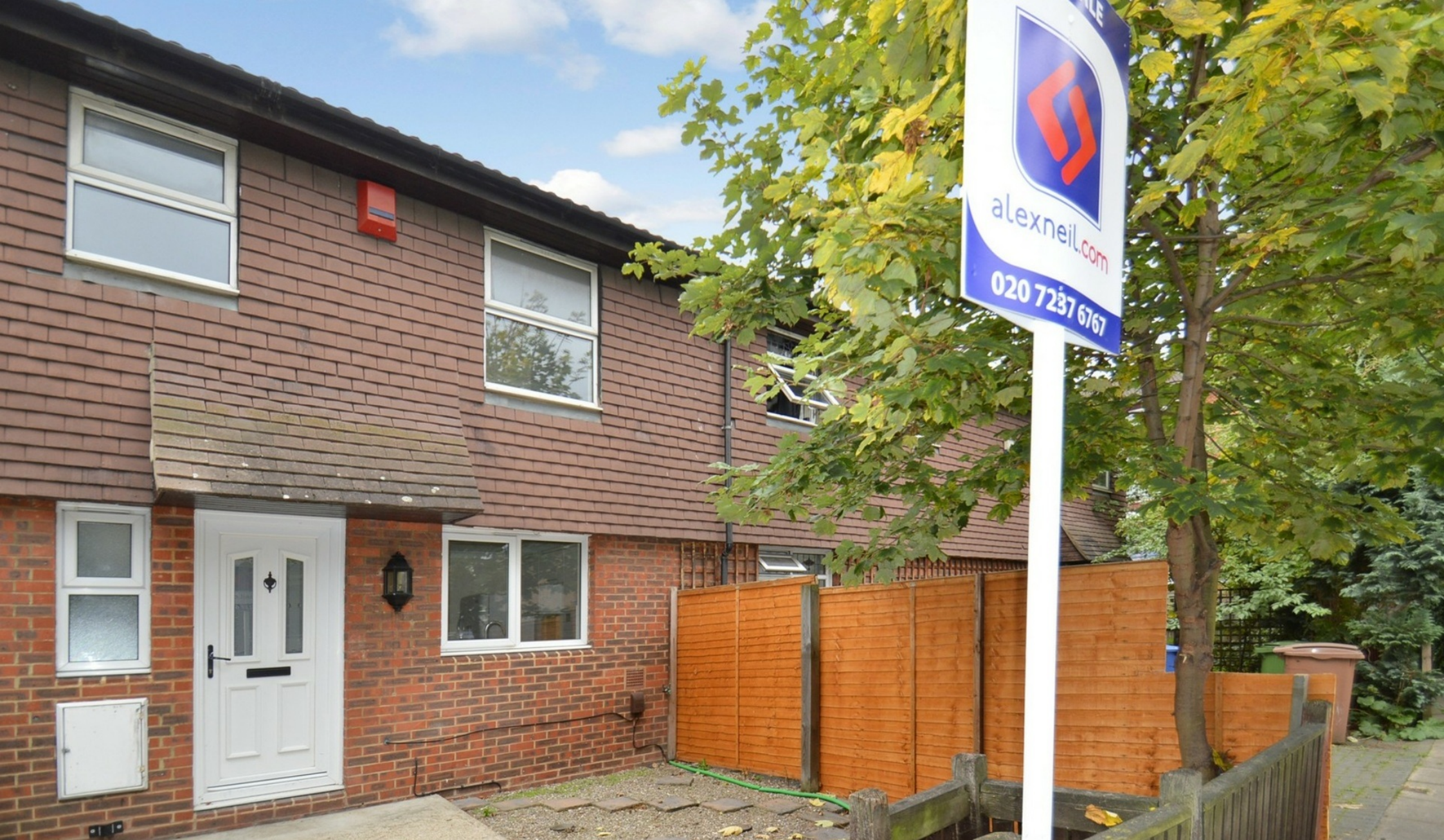
MOSSINGTON GARDENS SE16 5 bedroom terraced house