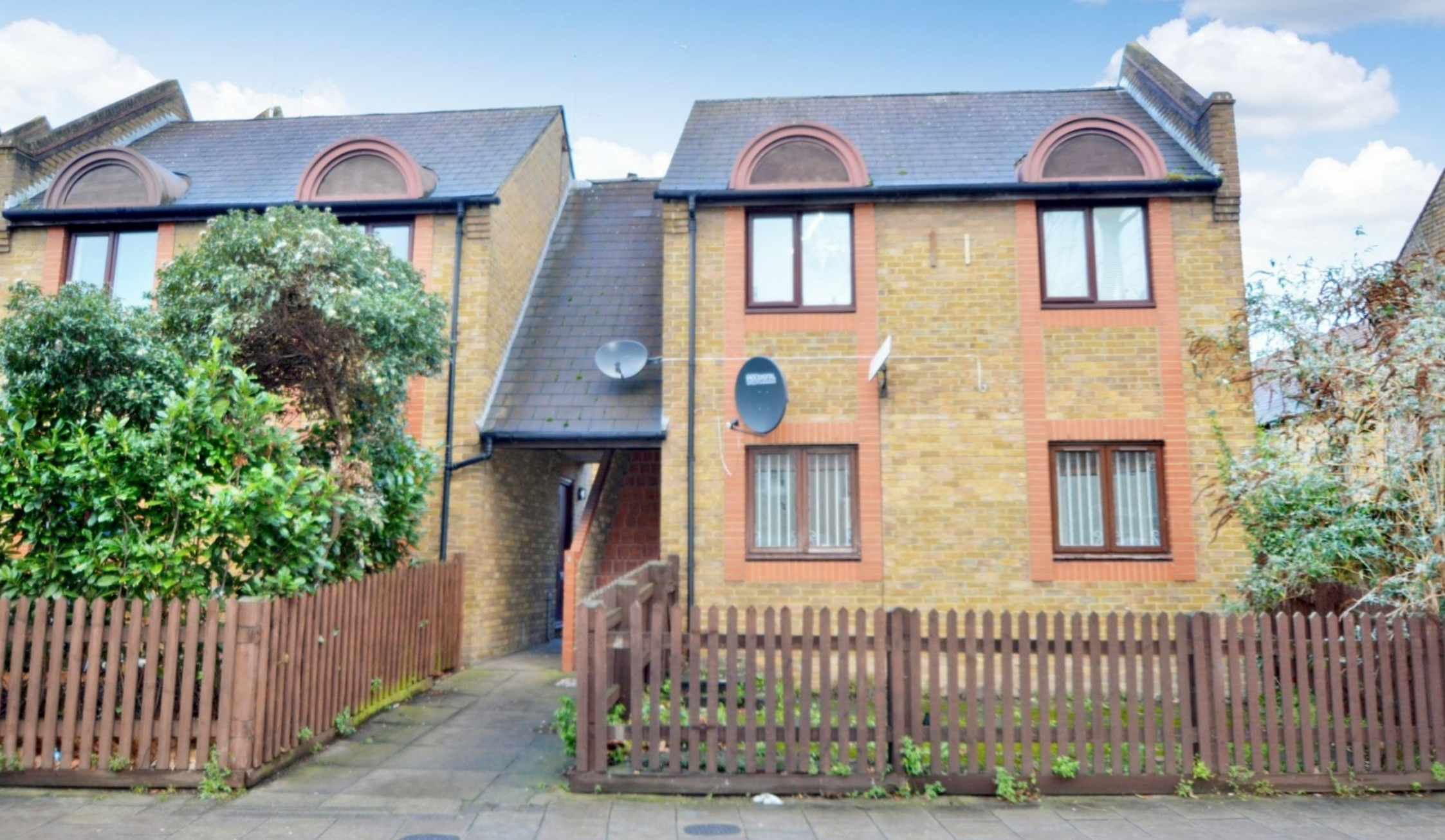
CLIFTON PLACE SE16 1 bedroom apartment